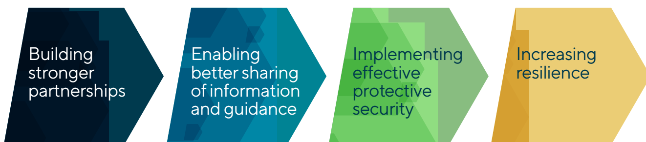
Figure 1: New Zealand's strategy for protecting crowded places

New Zealand's strategy has four elements that can be applied consistently, yet flexibly, to all crowded places (see Figure 1).