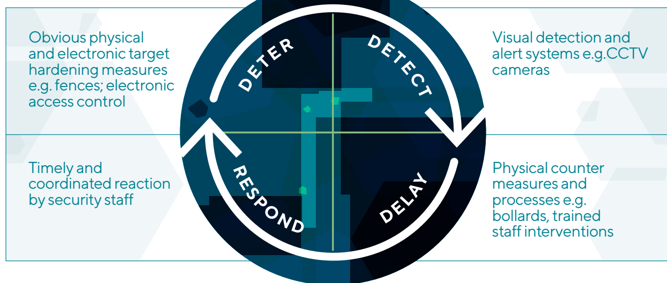
Figure 2: Layered Security

Refer to Figure 3 for examples of protective security measures in each layer that owners and operators of crowded places can use. Some security measures strengthen more than one layer. For example, security officers can help to deter, detect, delay and respond to an attack.